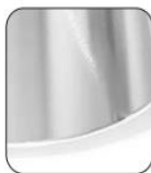
Anti glare Reflector