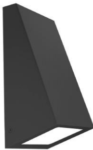
product from Spain