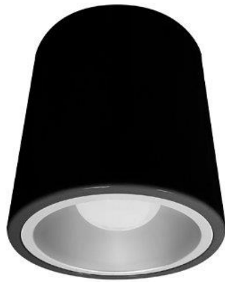
IP20 COLUMN AS