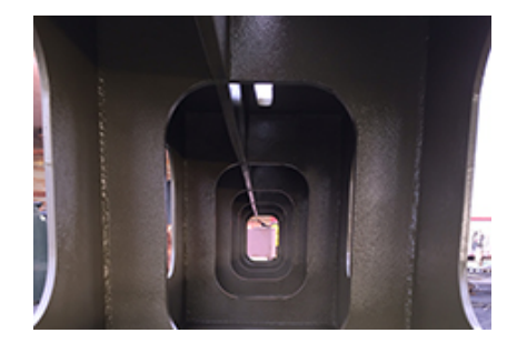
Intergard 7500 application