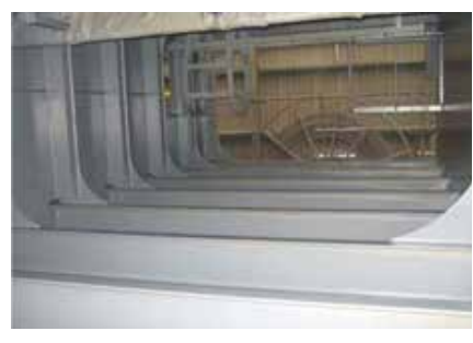
Block stage application