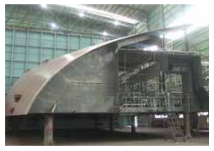
Intergard 7500 applied to a water ballast tank