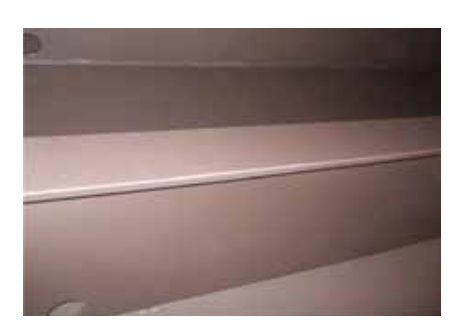
Excellent final appearance

Unless otherwise agreed in writing, all products supplied and technical advice or recommendations given are subject to the Conditions of Sale of our supplying company.