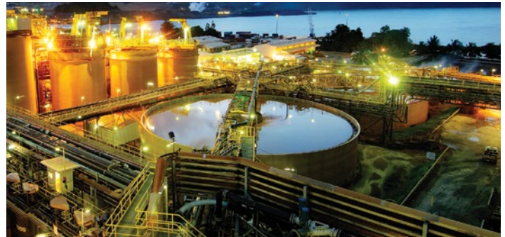
Lihir Gold Mine, Papua New Guinea, 2007: Versatility made Interzone® 954 one of the key products chosen for this major project.