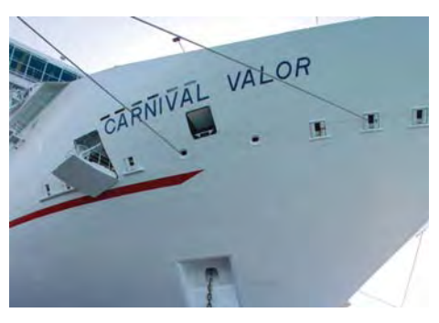
Excellent colour retention, maintaining good cosmetic performance over extended in service periods