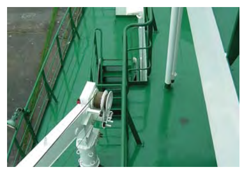
Interthane<sub>®</sub>990 on decks after 12 months in service