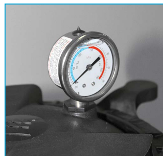
STAINLESS STEEL, OIL FILLED PRESSURE GAUGE