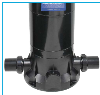
2 INLETS AND 2 OUTLETS TO FIT ANY PLUMBING CONFIGURATION