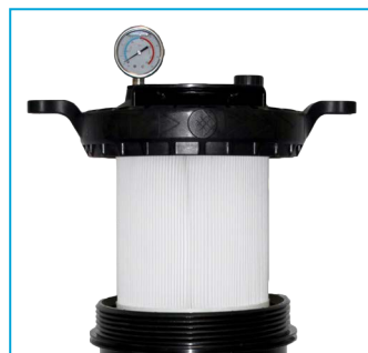
EASY CARTRIDGE REPLACEMENT