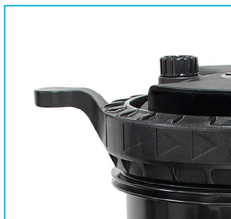
LARGE ERGONOMIC HANDLES FOR EASY SERVICE