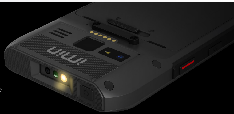
*1 Hyper Red 660nm LED