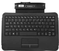
Companion Keyboard & KickStrap