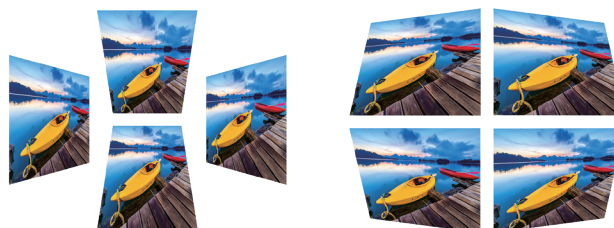
H/V Keystone: ±30°

The DH381 and DH385ST support vertical / horizontal keystone correction and 4-corner geometric adjustment, allowing for virtually unlimited mounting flexibility.