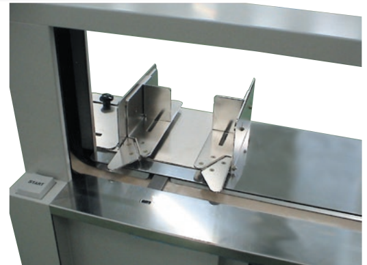
Auxiliary guide for soft materials helps bundling such as envelopes, letter papers etc. (For Tapit WXII, WII+)