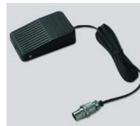
Foot switch for all models.