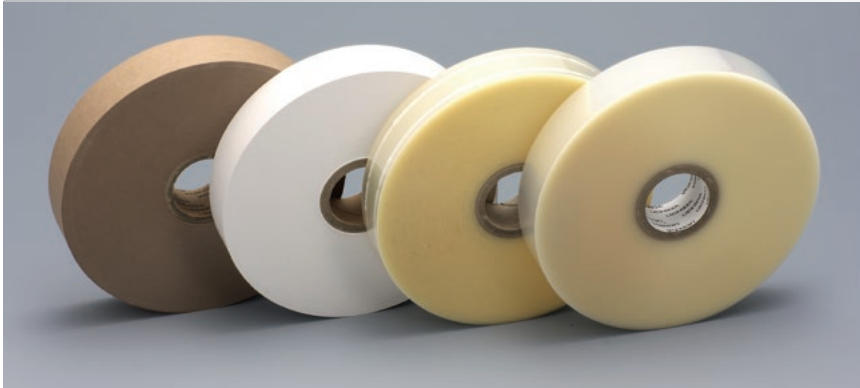
Kraft paper tape White paper tape Magic-cut tape Transparent film tape