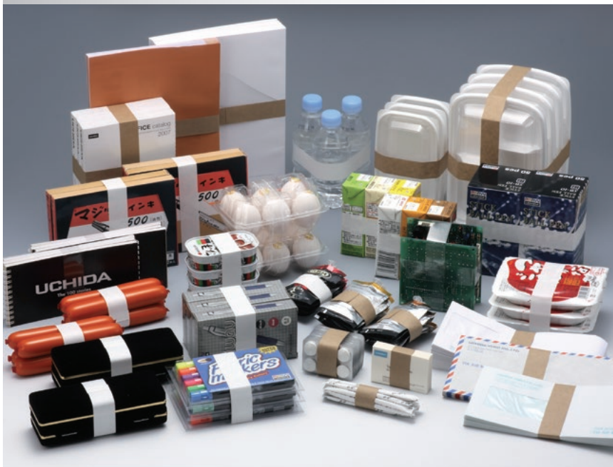
Bundling optimize your workflow in graphic, food, packaging, logistics, pharmaceutical and more industries.