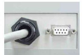
Optional AU device (I/O interface) helps automation.