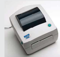
Optional Report Printer P/N: 002-9018 (110V) or 002-7181 (220V)

Inspector™ is a registered trademark of RJS Technologies, Inc. in the United States and/or other countries