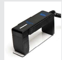
Optional Auto Optic P/N: 002-7852 (3,6,10,20 mil) or P/N: 002-7853 (3,5,10,20 mil)