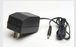
Optional Battery Charger P/N: 002-1425 (110V) or 002-1617 (220V)