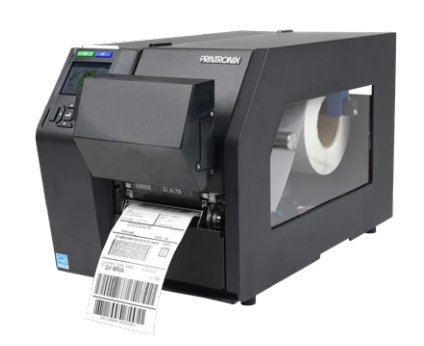
Barcode Verifier (T8000 ODV-2D)