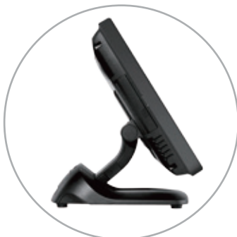
Full Extended Mode

The XT-3915IR-G2 provides the selection of two foldable bases, the curvy slim GEN7E base and the larger but practical GEN8E base. The foldable base can be configured into "Flat Folded Mode" to save the shipping package volume, "Low Profile Mode" to allow greater interaction between the cashier and the customer, and the traditional "Full Extended Mode". All this can be achieved with a simple pull of the hidden lever.