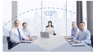
102° wide viewing angle