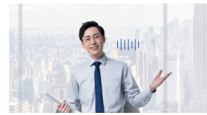
Sound source localization

The attendee who speaks in meeting is automatically tracked and showed in best view in real-time.