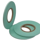
Inserting tab tape for Countron series.