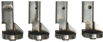
Suction blades for Countron Touch, T5 and Twin Touch.