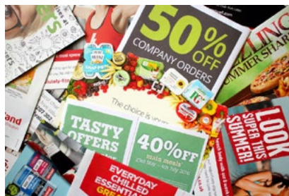
Flyer Direct mail