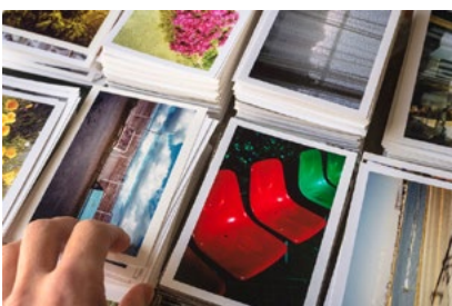
Digital print Photo card