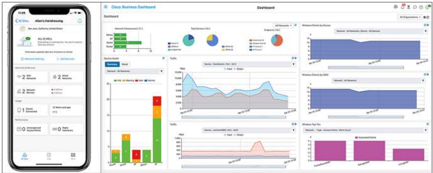
Figure 1. Cisco Business Dashboard and Cisco Business mobile app

The Cisco Catalyst™ 1200 Series Switches are affordable smart switches designed and built for small and medium-sized businesses. Managed through the Cisco® Business mobile app or dashboard, the switch portfolio provides a simple and reliable experience.