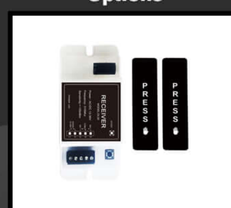
HSL-WLT-SW (Wireless touch switch)