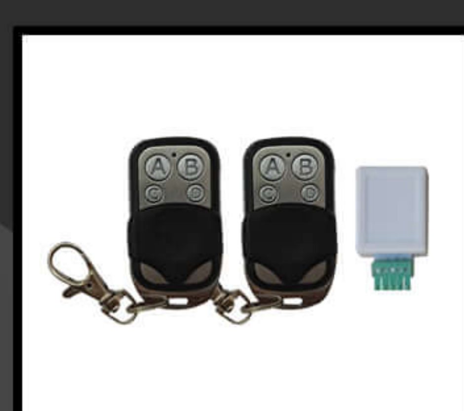
Remote Control (X2)