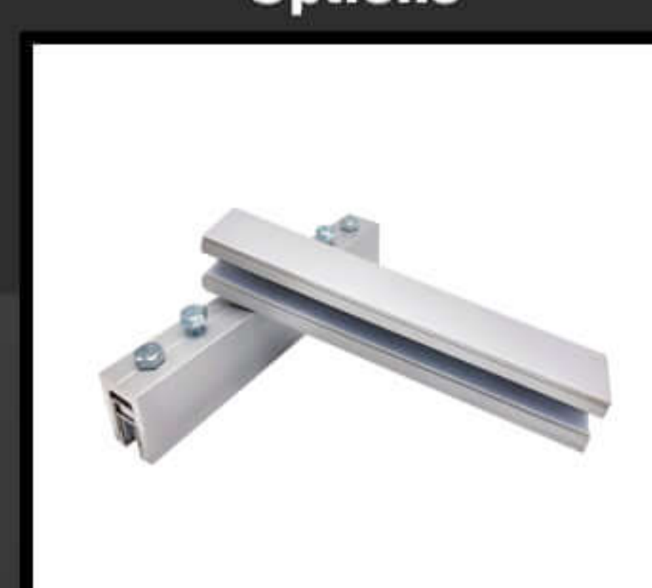
HSL-GL-CLAMP (Glass Clamp)