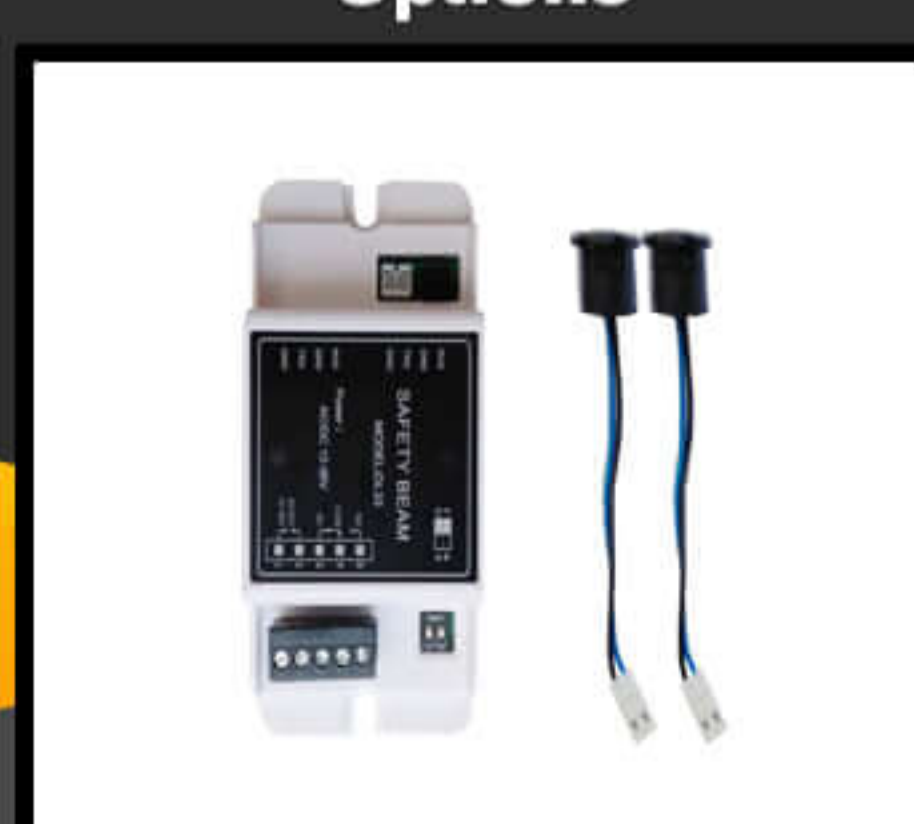
HSL-HAND-SW (Safety beam)