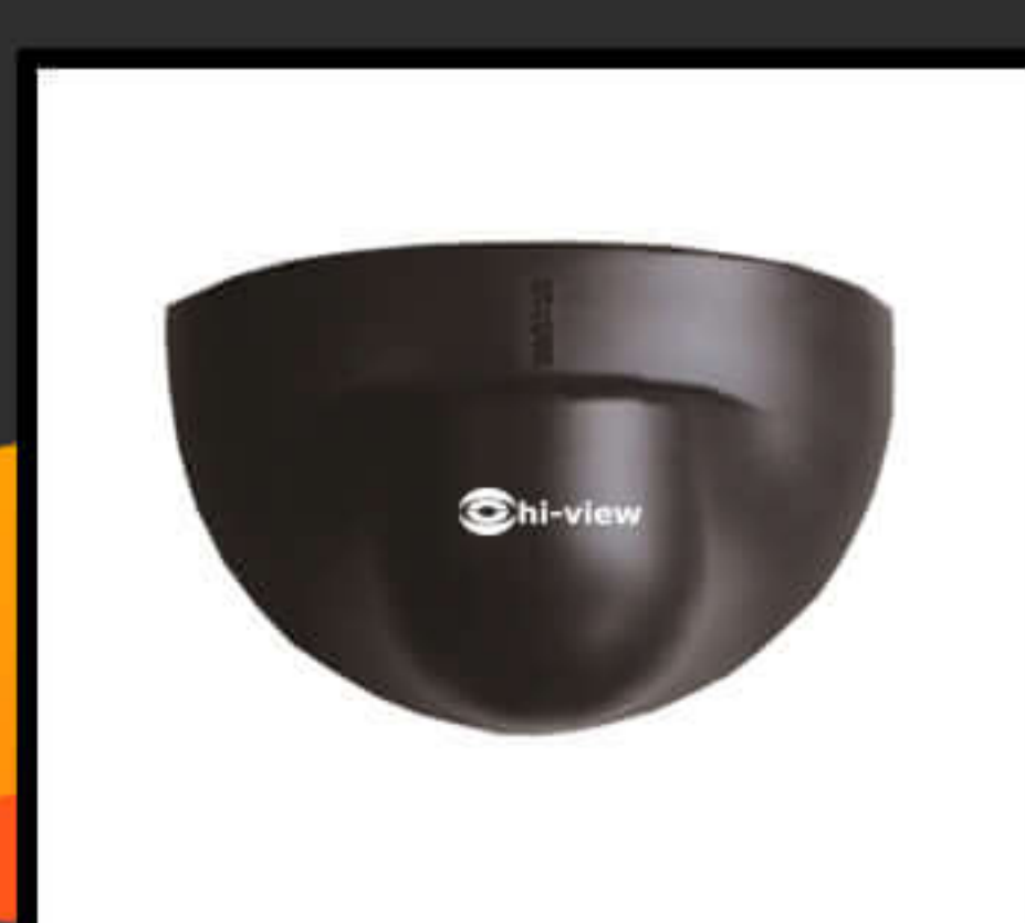
Microwave Sensor (X1)