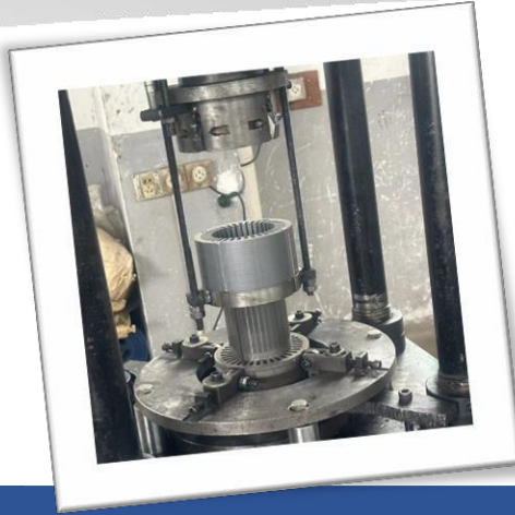
PART 1 : STATOR