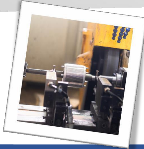
PART 2 : ROTOR