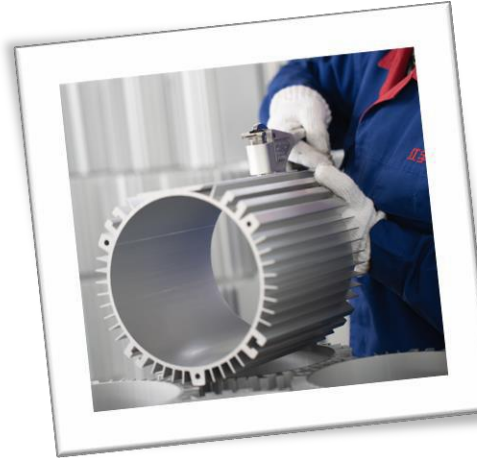
PART 3 : HOUSING