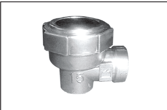
Capsule type for steam

Model JAV-CT11 [JKV-4] a self-operating air vent to be used for eliminating air or non-condensable gas contained in steam, solving the air binding to ensure constant heat transferability and to prevent corrosion at the inside surface of pipe. As a bimetal operated air vent, the operating feature depends upon the temperature differential between steam and air. The valve closes at the steam temperature and opens when air or gas flows into the air vent.