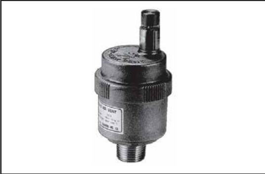
Float type by bubble crush method for water

Application of BBC (Bubble Crush) method has made it possible to have no chattering and water-hammer. The valve disc and seat are easily removable with cover : even if soiled with scale and dust, they can be easily. Small in size and maximum working pressure is graded up to 10 kgf/cm 2 g {1.0MPa} Largest air venting capacity in this class. Provided with manual operating device.