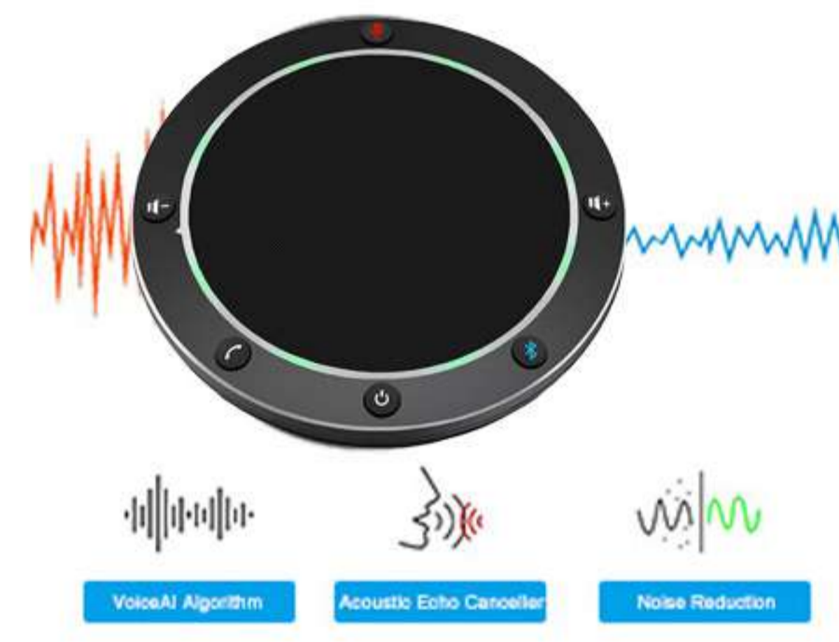
Echo cancellation and noise reduction