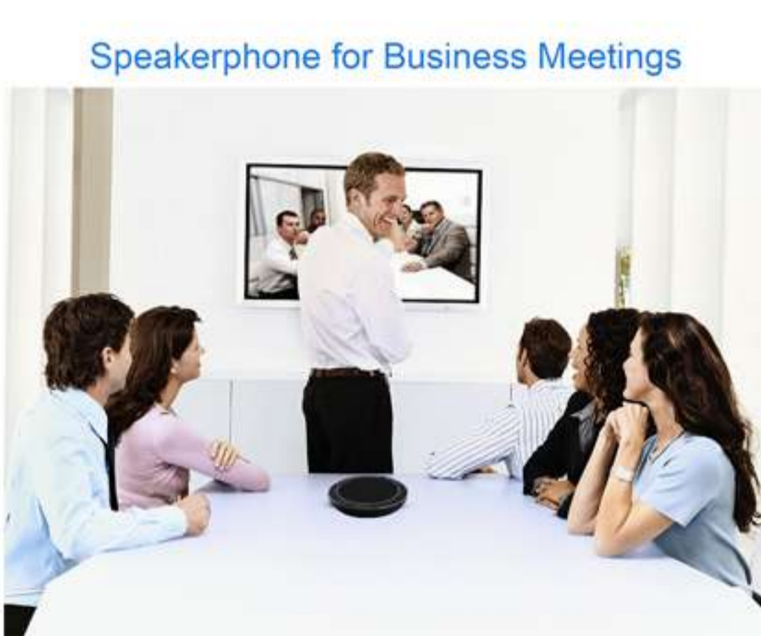
Speakerphone for small meeting