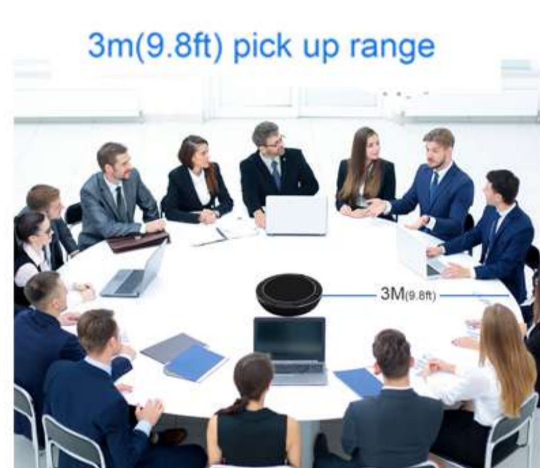
3 m sound-pickup diameter