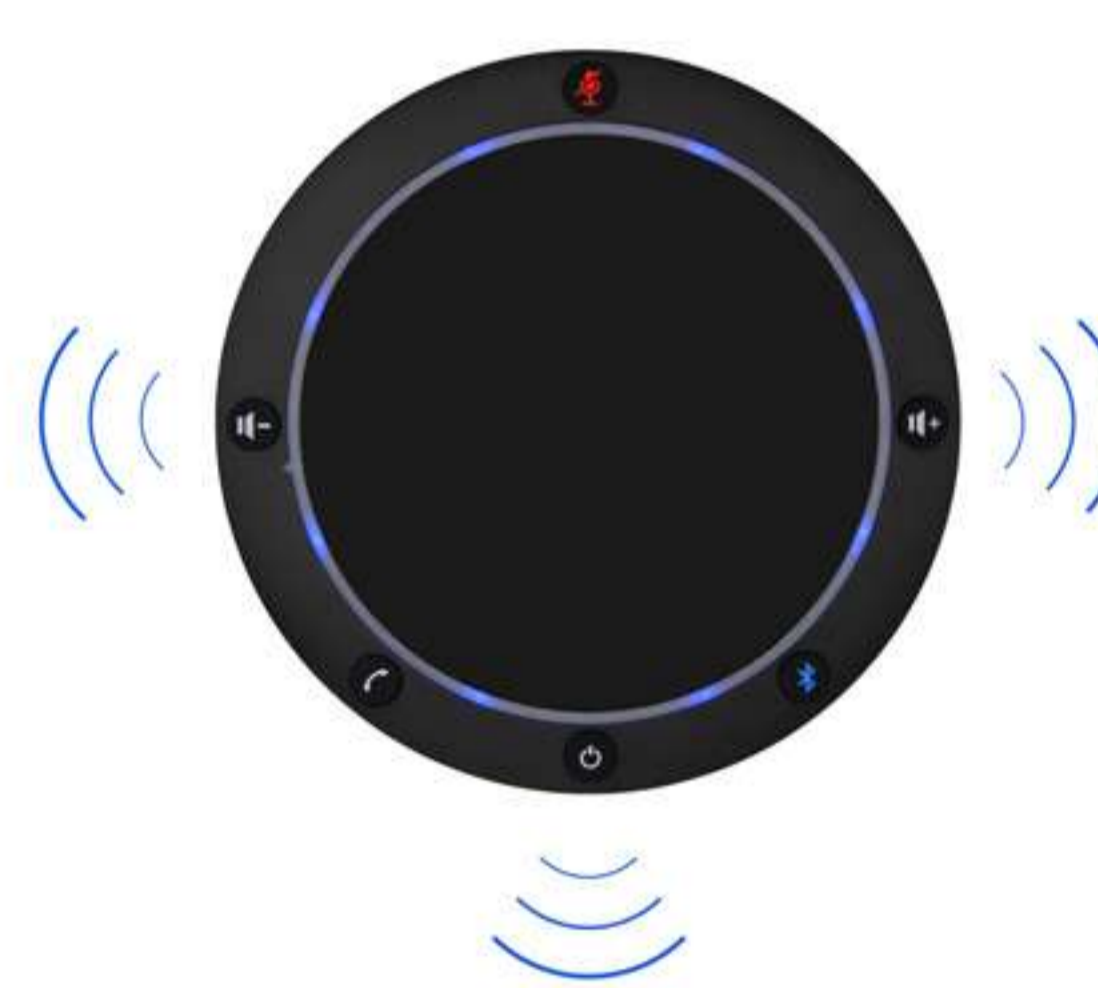
Built-in Omni-directional microphones