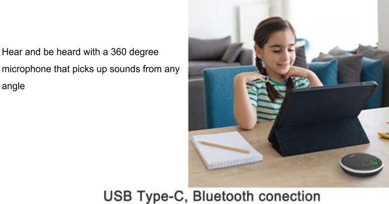
Built-in 2 Omnidirectional Microphones