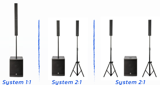
ACS-1200S Series application support