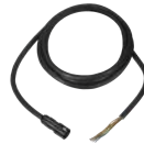
WV-QCA502 I/O Cable for Aero PTZ camera