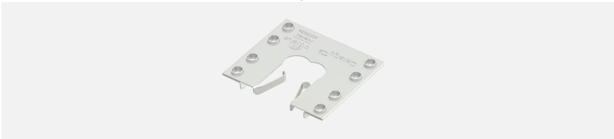
Grounding Clip,with Clenergy Logo Part No.: EZ-GC-ST