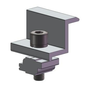
PV-ezRack End Clamp, Standard Part No.: ER-EC-ST