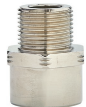
Gland nut Female Threads ended