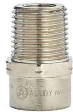
Body (Entry thread)