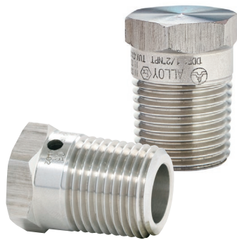
Approx. Weight ; 0.080 kgs.